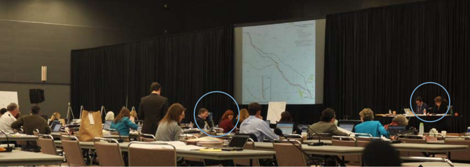
a glimpse of the Austin Convention Center hearing room with Clear View legal team, front and center of the Administrative Law Judges

The ALJs recognize the importance of environmental integrity in their discussion of a number of specific concerns raised by the parties at hearing, and as a foundation for their decision to recommend Staff MK15. In their discussion of fragmentation, the greatest concern of the Texas Parks and Wildlife Department (“TPWD”), the ALJs state that “the absence of a major highway or transmission line for much of the central study area argues against placing the line there and favors paralleling the I-10 corridor.” Yet, Staff MK15 detours away from the compatible right-of-way of Highway 277 and I-10 and instead cuts diagonally through a large portion of the study area on links b14a, b14ba, b84, b86, and b90.